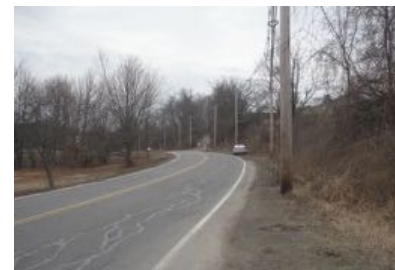
Old Ayer Road

With an approximate paved width of 20-22 feet, Old Ayer Road is functionally classified by MassDOT as a Rural Minor Collector and is within a Town of Groton layout approximately 62-63' in width. It is posted for a 40 miles per hour speed limit just south of the site. It is marked by a double yellow centerline and white edge lines along the site's easterly frontage. Old Ayer Road generally has a north to south orientation. It originates to the south at the Ayer Town line and ends to the north after turning easterly at Boston Road (Routes 119/225). While Old Ayer Road provides access the Nashoba Valley Medical Center at the Groton/Ayer line, open undeveloped land is located opposite the MCIH site. Its pavement is typically in fair/good condition.