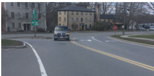
Lowell Road Looking west to Main Street

The northbound Main Street approach to Lowell Road forms a right turn lane channelized by a triangular landscaped island. It is wide enough for traffic to pass to the right around left turning motorists. Sidewalks are provided on all sides except the east side of Main Street and the south side of Lowell Road. Approach lanes are