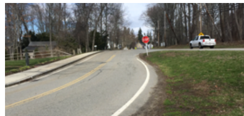
Old Ayer Road North