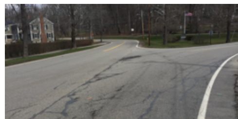
Old Ayer Road

Old Ayer Road North has a north to east T alignment at its intersection with Old Ayer Road South. Westbound Old Ayer Road South is controlled by a stop sign and stop line.